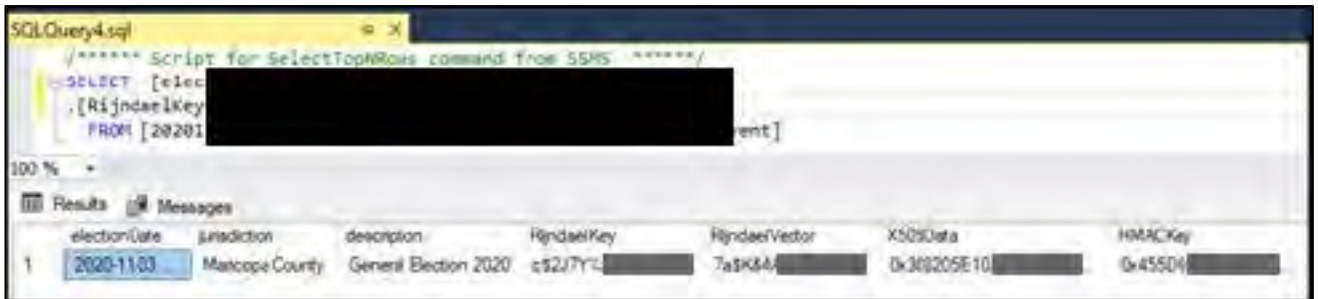
Figure 7 - Rijndael Key for Maricopa 2020 Election

encrypt, decrypt and authenticate data. This data includes code signing, data signing, communications, and tabulator results from ICC or ICP2 components. The protection of election encryption and decryption keys is prominently described by DVS within Democracy Suite Technical Data Package documents as the mitigation for the risk of a malicious actor tampering with the election database, election result files, scanned ballot images, device audit logs, device log reports, ballot definitions and other critical elements that could allow authorized or unauthorized parties, to alter the outcome of an election without detection. These keys have been left unprotected on the election database and are in plain text as shown below: